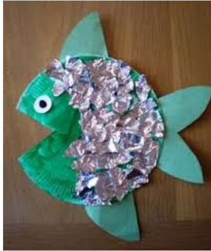
Aluminum foil Paper plate